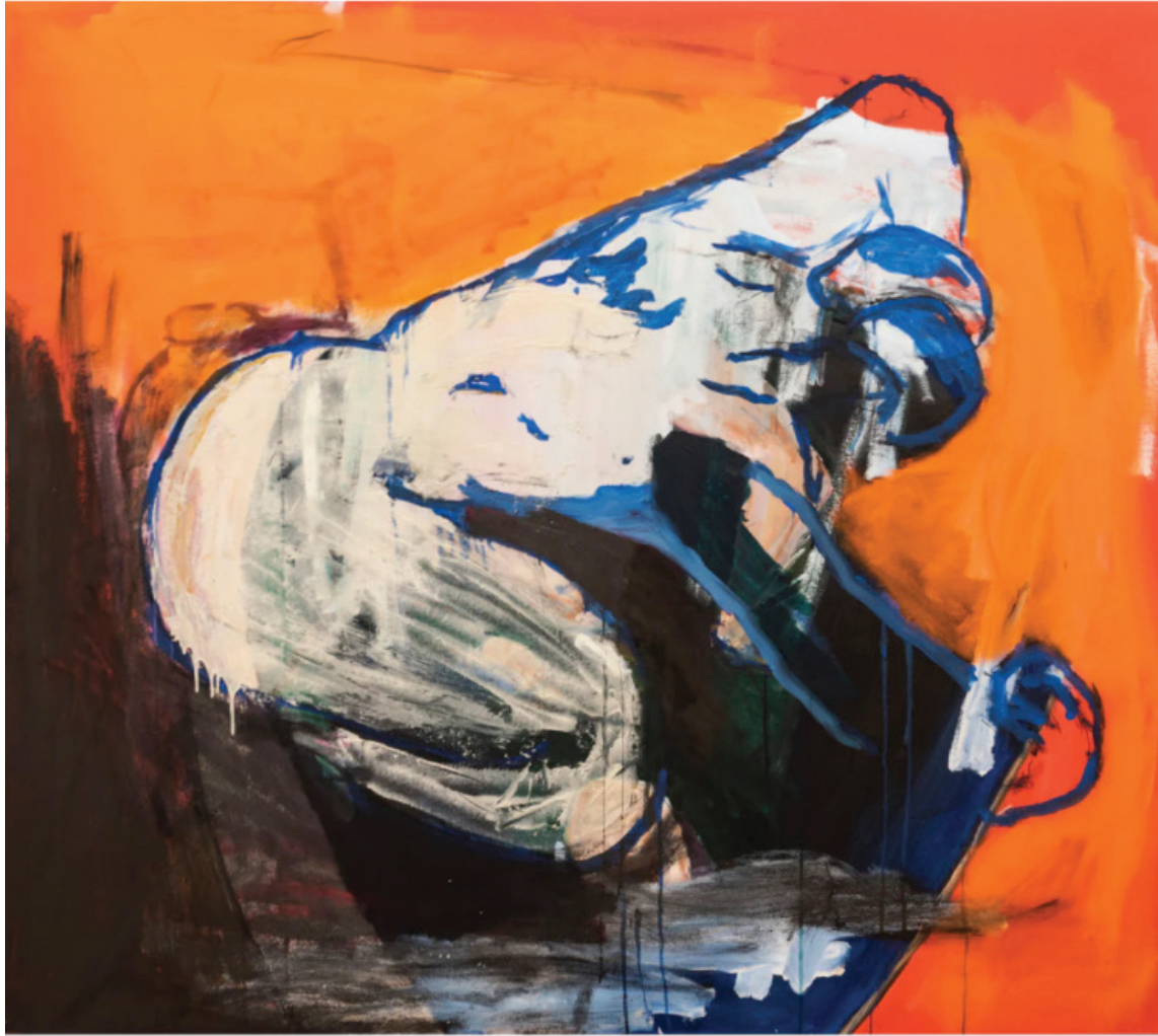
Drudge , 2024, oil on canvas, 150x160 cm