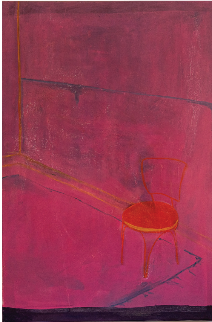
Rose Room , 2024, Oil on canvas, 185x140 cm