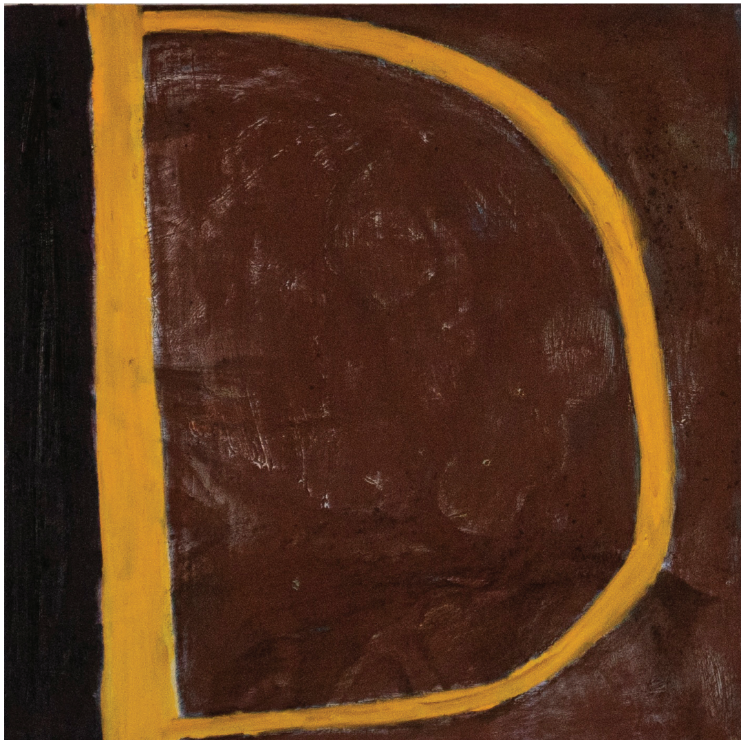
Colour Study , 2025, Conty on Board, 20x20cm