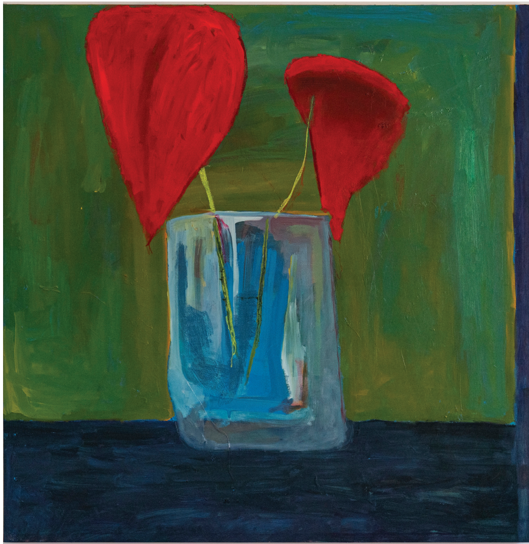
Pedal Vase , 2025, oil on canvas, 150x140 cm