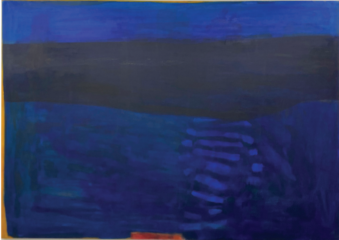
Midnight Escapee , 2024, oil on canvas, 160x200cm