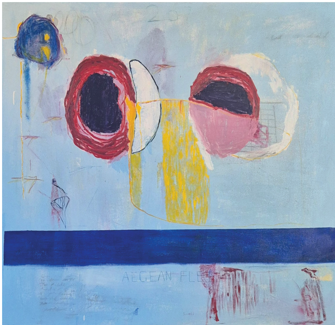
Aegean Fleet , 2023, oil on canvas, 160x150 cm