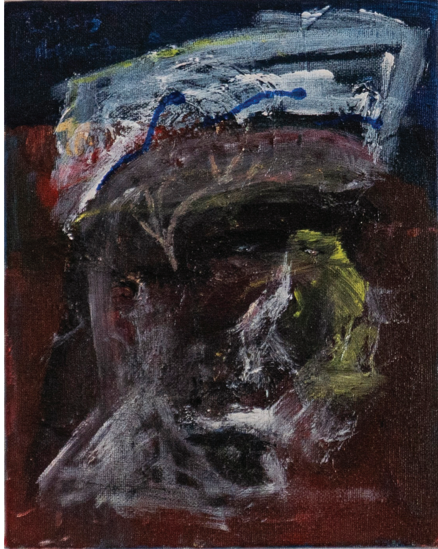
Alexander the Great , 2024, Oil on Canvas, 20x12cm