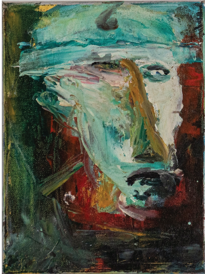
Van Gogh Portrait , 2021, Oil on canvas, 25x15cm,