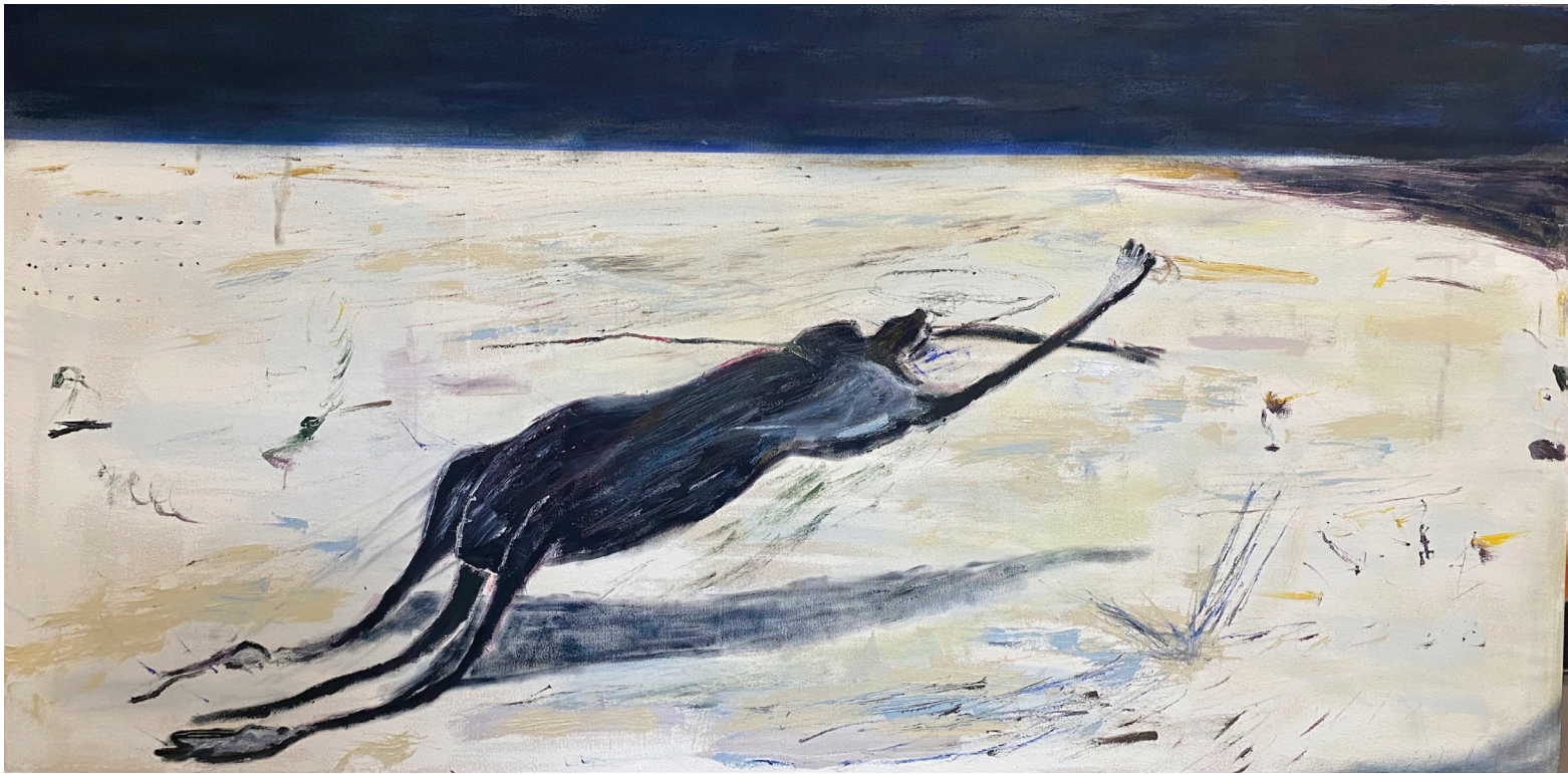
Road Kill no.2 , 2024, oil on canvas, 40x140cm