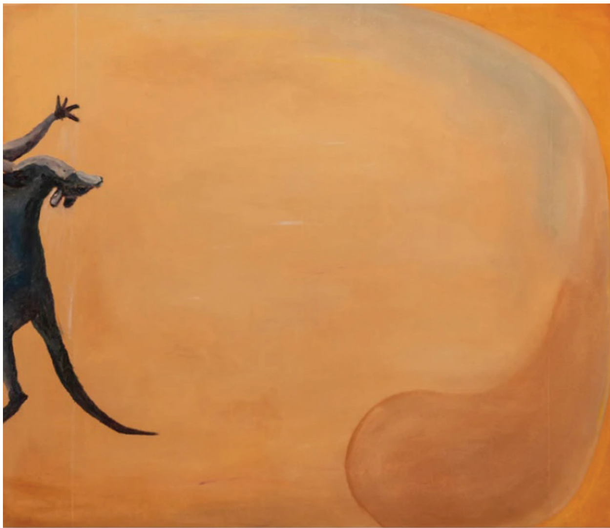
Road Kill , 2024, oil on canvas, 170x150 cm