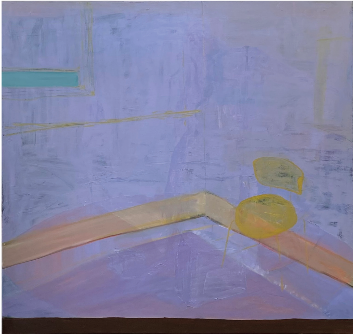
the Old House , 2024, oil on canvas, 195x185 cm