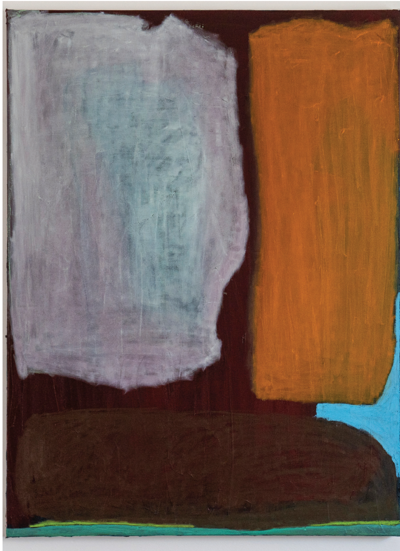
Colour Study no.3 , 2025, oil on canvas, 140x100cm