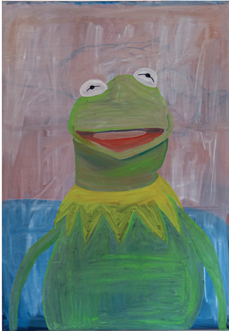
Kermit , 2025, oil on canvas, 200x160 cm