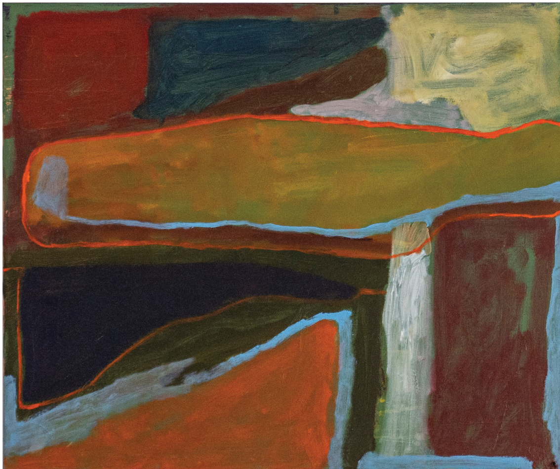
Colour Study , 2025, oil on canvas, 30x40cm