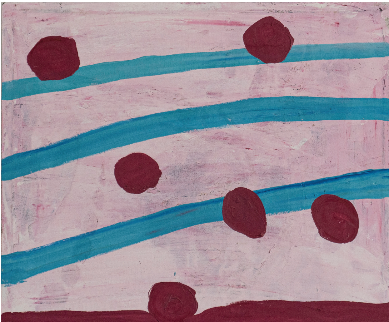
Apple Tree , 2025, Enamle on Canvas, 50x60 cm