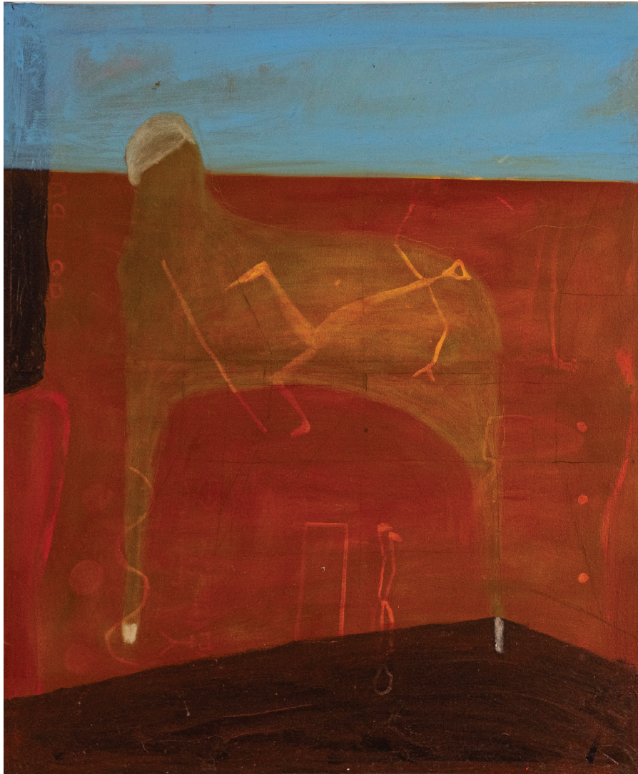
Bull in Desert , 2025, oil on canvas, 140x110