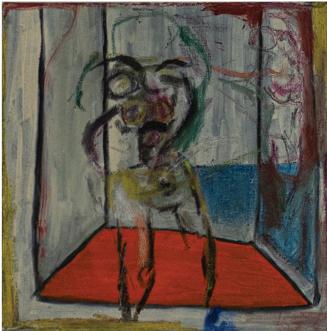
Tango , 2025, Oil on canvas, 15 x 15cm